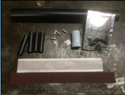
Contents of submersible pump cable splice kit.