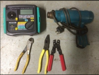
Tools required to cut, crimp, heat and test completed cable splice.